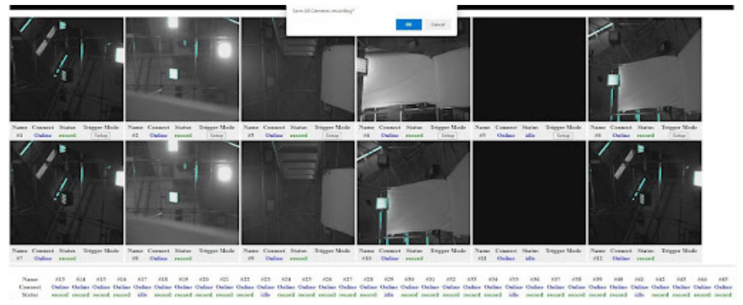
Tunnel Monitoring Software