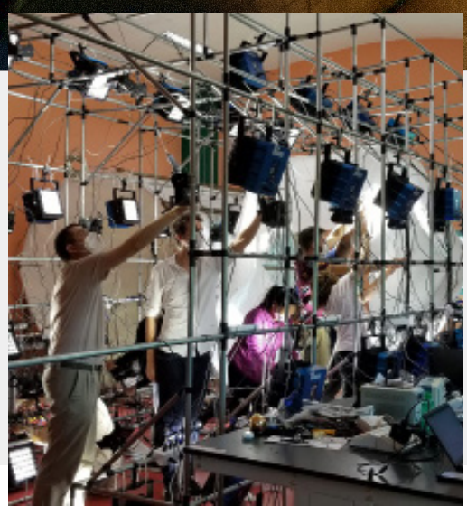
Researchers setting up Chronos Cameras