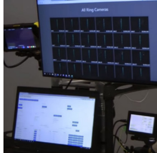
Chronos Camera Testing